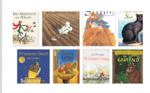
Figure 4 A Family Sharing Book

much as possible and sign their reading planner.