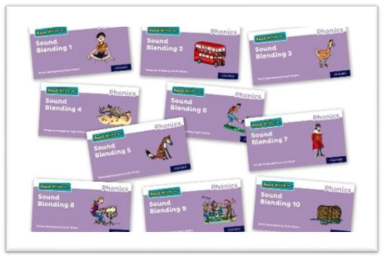
Figure 1 Sound Blending Books

Once your child begins accessing the Read, Write, Inc. (RWI) programme in Reception they will be given a RWI reading book. In the early stages of the programme your child will be given a 'Sound Blending' book which reinforces the sounds your child has been taught in their RWI sessions in school. The sounds are taught discretely during their Phonic sessions and your child should be able to apply their segmenting and blending skills when they are practising with this text at home. As your child moves through the RWI programme the books become more challenging.