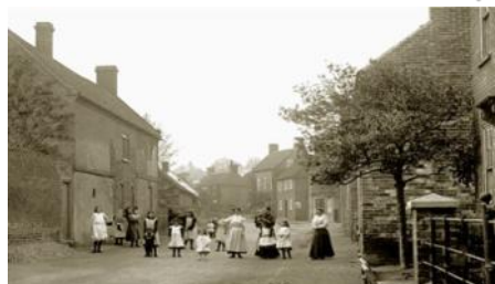
← Flintham in Victorian times.

Key Learning: Historians believe Flintham village dates back to the Roman times . It became a settlement because it was close to the Fosse Way (the A46)